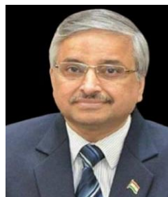
Dr Randeep Guleria Director, AIIMS, Delhi

Live YouTube link: https://youtu.be/Lp2YCu2kkoU